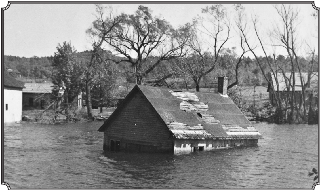
HURRICANES, FLOODS, AND A NEW HIGH SCHOOL! THE 1930s DEPRESSION ERA IN ANDOVER